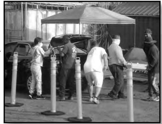
Mr. K's Recycle & Redemption employees collect electronics from a customer at the Hilo Electronics Recycling Collection Event on January 14, 2023.

Please visit the State of Hawai'i Department of Health's electronics recycling website https://health.hawaii.gov/ewaste/ for more information on manufacturer-sponsored electronics recycling and the new law. Visit the County's recycling website, www.hawaiiizerowaste.org , for other types of recycling information, announcements of upcoming events, and to register for Solid Waste Notifications (via email or text).