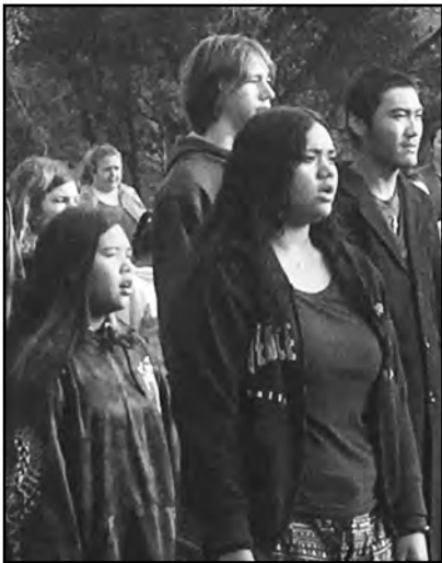
High School students at morning piko wehena

When the Hawai'i state legislature passed a law in 1998 allowing the creation of independent, publicly funded charter schools, this group began the application process. Two years later they were among the first to be awarded a charter by the Department of Education.