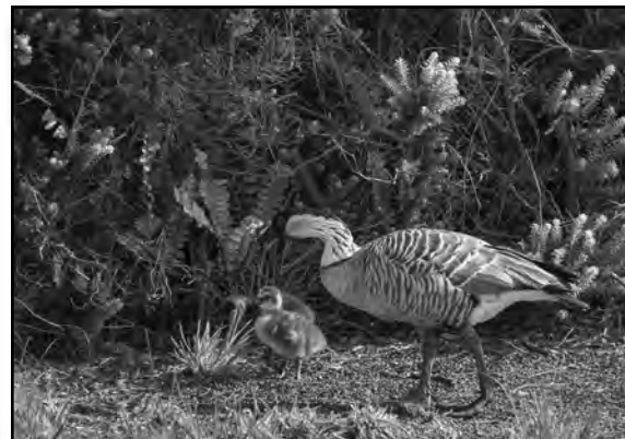
A nēnē (Hawaiian goose) guards its young goslings.

To learn more about nēnē, visit the park website for history, a video, and a podcast about these rare and magnificent native geese.