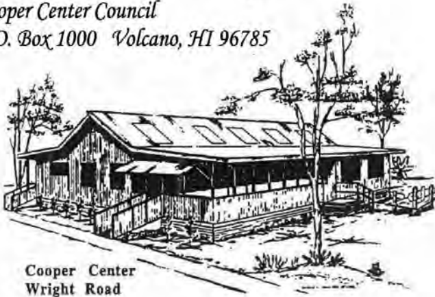
Cooper Center Wright Road

Non-Profit Org U. S. Postage Paid Permit No. 12 Volcano, HI 96785