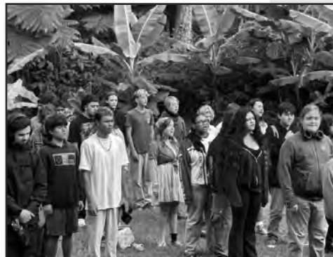
High school students oli at morning Piko Wehena (opening protocol).