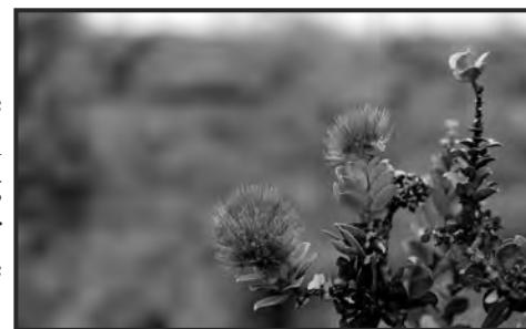
Two scarlet blossoms on an 'Ōhi'a lehua bloom in Kahuku

Stewardship at the Summit Rainforest Restoration. Volunteer to help remove invasive, non-native plant species that prevent native plants from growing in Hawai'i Volcanoes National Park. Wear sturdy hiking shoes and long pants. Bring a hat, rain gear, day pack, snacks and water. Gloves and tools are provided. Under 18? Parental or guardian accompaniment with written consent is required. Visit the park website for details. When: September 6, 20 & 27 (National Public Lands Day). Meet at 8:45 a.m. Where: Meet project leaders Paul and Jane Field at Kīlauea Visitor Center parking lot on the dates above. (The meeting place is open during the visitor center renovation.)