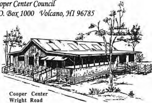
Cooper Center Wright Road

Non-Profit Org U. S. Postage Paid Permit No. 12 Volcano, HI 96785