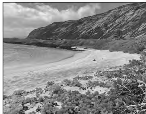
The beach at Halapē.

Currently, backcountry overnight hikers can get a permit seven days in advance. Visitors to the new Hawai'i Volcanoes National Park Backcountry Permits page on Recreation.gov will be able to make reservations 90 days in advance of their planned trek. Seventy-five percent of the backcountry permits will be available online. The remaining 25% will be available in person at the Backcountry Office seven days before your start date.