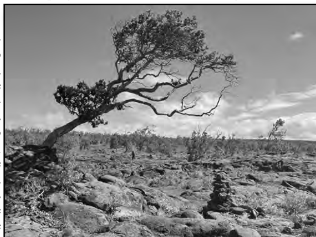
A hiker in the distance walks on hardened pāhoehoe lava to- wards the backcountry trailhead at Mau Loa o Maunaulu.

Recreation.gov is the Fed- eral government's one-stop shop for trip planning and reservations to explore America's outdoor and cul- tural destinations. Visitors can use Recreation.gov to make campsite reservations, secure permits, schedule tours, purchase passes and more for all federal lands and waters throughout the country. Find incredible places and experience that help you bring home a story through Recreation.gov.