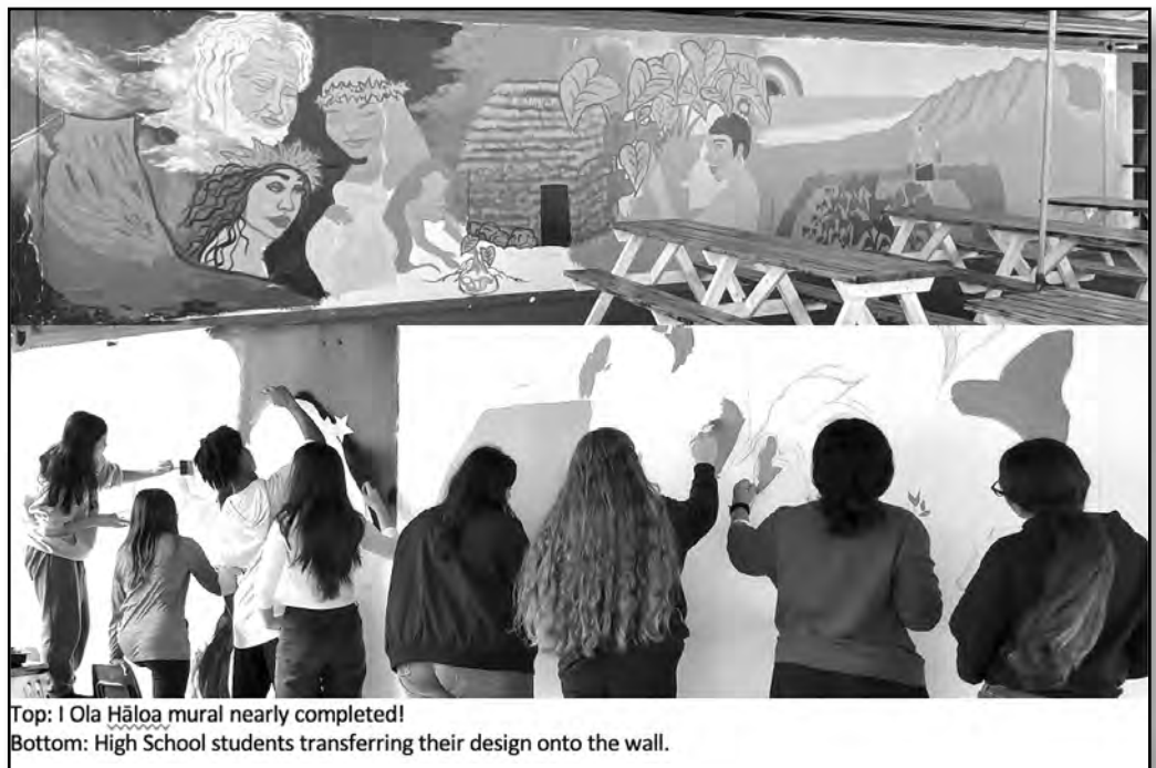
Top: I Ola Hāloa mural nearly completed!