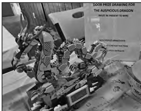
DOOR PRIZE DRAWING FOR THE AUSPICIOUS DRAGON (MUST BE PRESENT TO WIN)

WITH DEEPIEST APPRECIATION TO CONSTRUCTION TEAM FOR PUNA BROTHERS