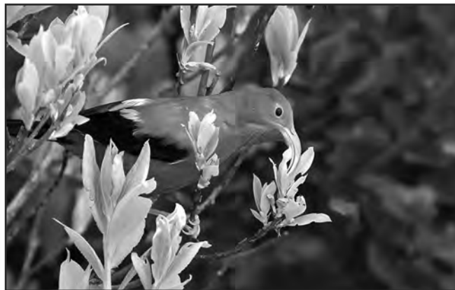
A brilliant red Hawaiian i'iwi honeycreeper is perched on native 'a'ali'i shrub.